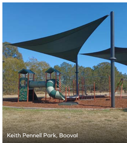
Keith Pennell Park, Booval