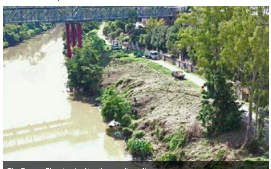
The Bremer River bank after the weeding blitz.

"We will continue to deliver targeted actions and investment to improve the Bremer and other Ipswich waterways."